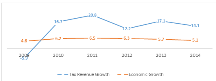
Figure 1. Economic Growth and Tax Revenue Growth of Indonesia, 2009 – 2014

In total, the output identities, tax and government spending are the components that build up the total aggregate output. New Keynesian economics and real business cycle theory can be used to understand the relationship between fiscal policy behaviors and business cycles. If there is a relationship between a change in fiscal policy on the business cycle, then the New Keynesian Theory is said to have occurred. However, if there is no relationship occurring between a change in fiscal policy on the business cycle, then the Real Business cycle theory which bears government intervention when the economy is limited, is said to have occurred. For policy makers, the correlation of business cycles in each country provides some understanding as to how their economy works and fluctuates (Mansokku, 2013).